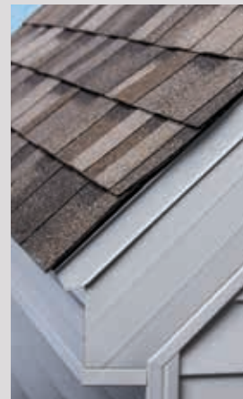
◀ Blends into roofline with a low-profile, 3-plane design ▼