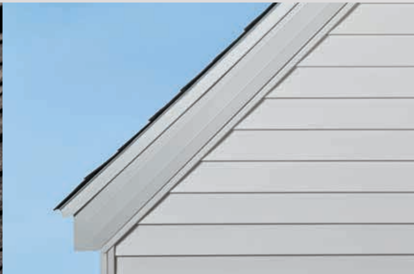
◀ At-eave application ▶